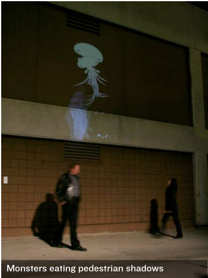
Monsters eating pedestrian shadows