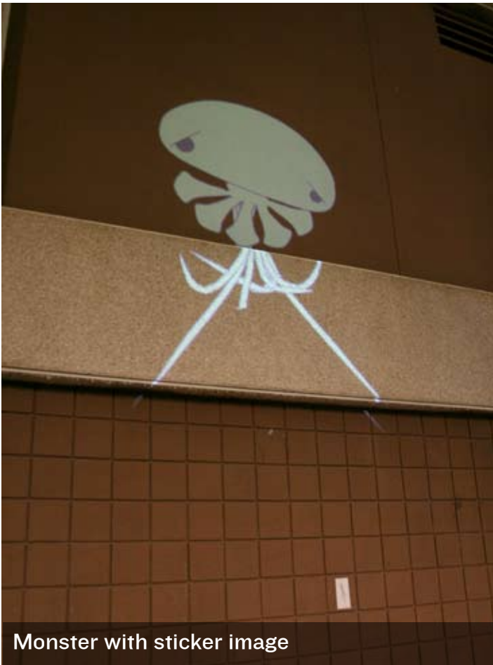
Monster with sticker image